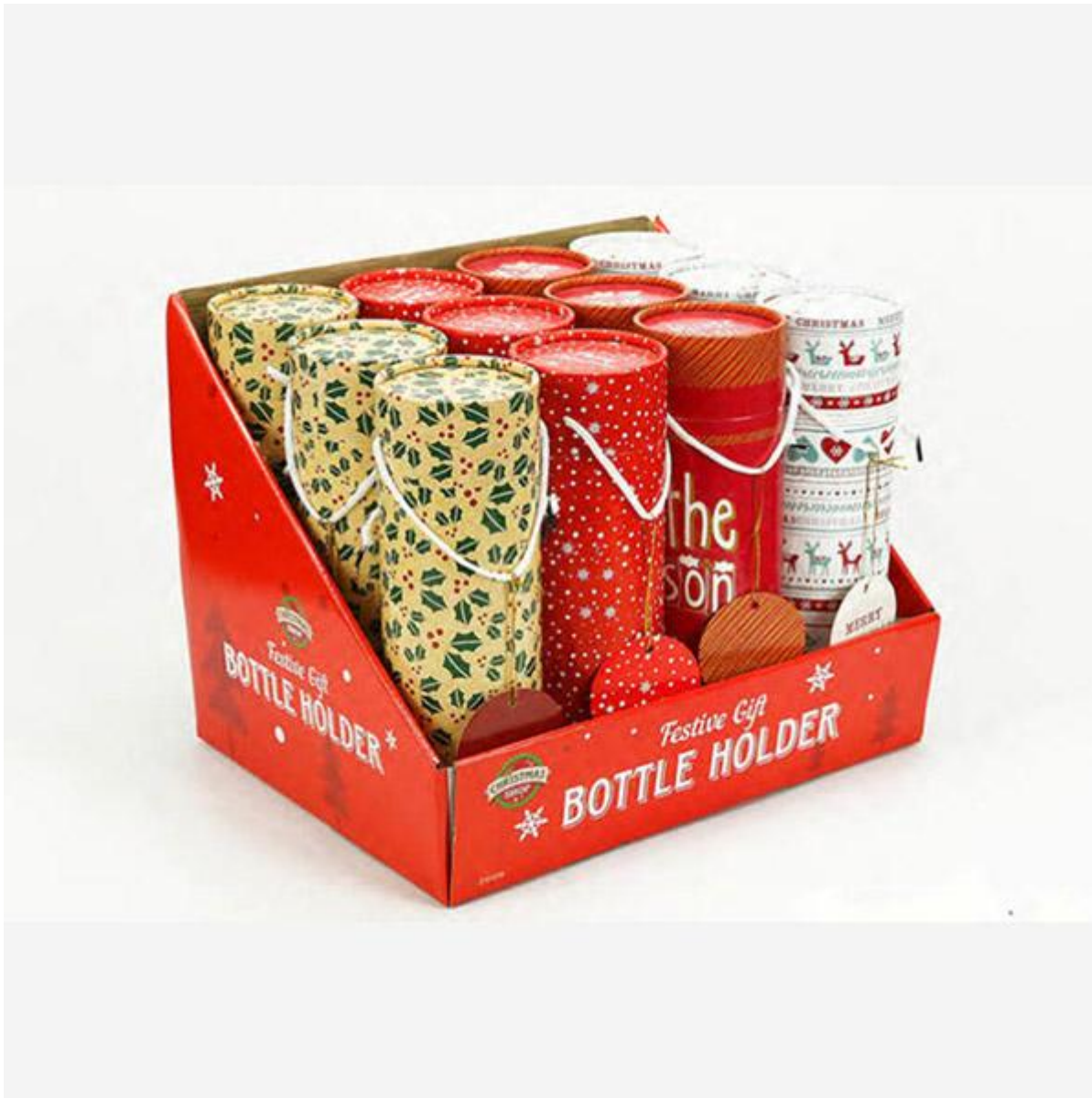
Sinst Christmas Gift Paperboard Printed Counter Display Process